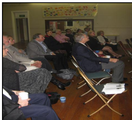
An interested audience enjoying the presentations

On September 21 a group of Fellows gathered for a Churchill Chat at the Malvern Hill Uniting Church Hall. A Churchill Chat is a forum focusing on the work of a small group of Fellows with similar professional experiences and interests. Unlike our more formal occasions, when new and returning Fellows have limited time to present their work, the Chats allow Fellows to discuss their projects in detail. The topic for the September Chat was 'Fellows helping in disasters'. There were four presenters.