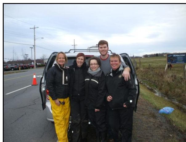
End of day, job done, team photo.

In a quiet clearing within the woods sat a backpack on a fallen tree trunk and various scattered personal effects. Further in we began to detect the quiet remains of a human being. Very sadly, these had already been discovered by coyotes over the course of the previous year and were spread over a large area. The next 10 hours or so were spent crawling through the llama faeces, swamp, scrub and mud, to systematically locate and recover all biological and evidentiary material related to the case. In the photograph above, I'm the one in the yellow pants. Glad they caught my best side for the front page of the local newspaper! Believe me, this work is nothing like the TV show, CSI!!!!