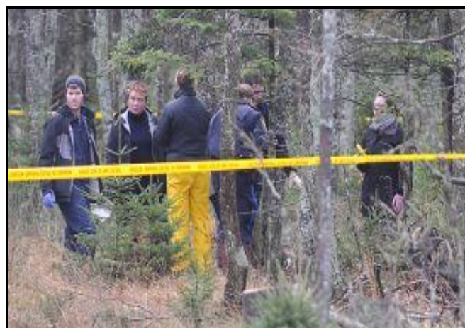
Our team captured by media photographer with a telephoto lens

Changing into appropriate clothing (five layers thick including waterproofs), we carried our gear to a staging point within the paddock and headed into the woods.