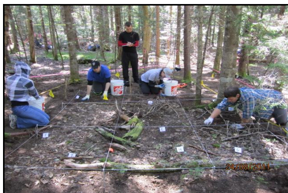
Students at work at site # 1: Mt Uniacke Estate, Nova Scotia, Canada

My first official travels involved travelling to Halifax, in the province of Nova Scotia, to help teach a week-long field school in forensic archaeology for St Mary's University. The field school was conducted at Mt Uniacke estate, 40 km north of Halifax. Four grave sites, complete with large animal bones and other evidentiary items, had been established 8 months earlier.